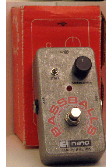
ELECTRO HARMONIX BASSBALLS Funkig sjuttioals baseffekt