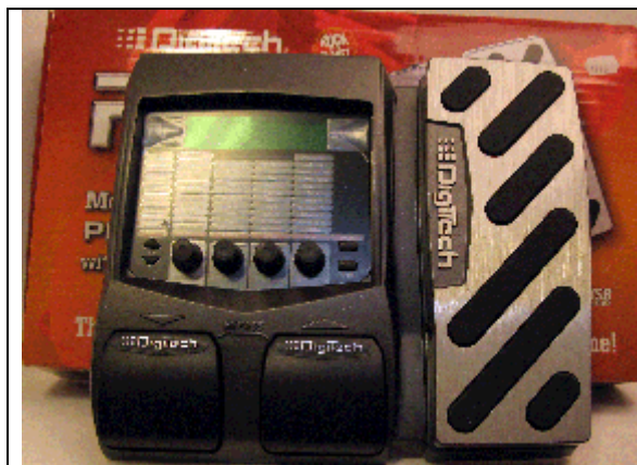
DIGITECH RP-250 Gitarmultieffekt med USB